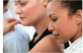
Add a different face to genetic counseling.

Consulting with a genetic counselor is an intensely personal experience. It demands a special bond of trust and understanding – the kind of bond that comes from belonging to the same community. Unfortunately, only 3 percent of genetic counselors in the United States are African-American or Hispanic. That's not enough. You have their trust. Now, you can become a trusted resource for your community.