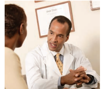
Genetic counselors and physicians work together to make a difference.