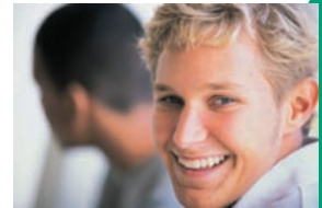
Take advantage of unique opportunities.

There are a variety of career settings that serve many different people. You could focus on cancer screening at a private practice. Or maybe you would prefer to counsel expectant parents at a community clinic. New and different opportunities regularly become available. Choose a path or create your own.